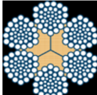
6 Triangular Strands