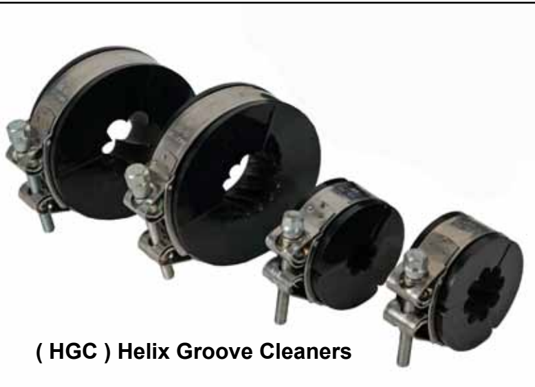
( HGC ) Helix Groove Cleaners

CoreLube Equipment's Helix Groove Cleaners are designed to remove contaminants from the valleys between the strands of wire rope. The cleaner works by rotating with the helical lay of the wire rope.