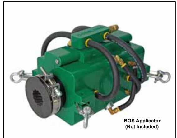
BOS Applicator (Not Included)